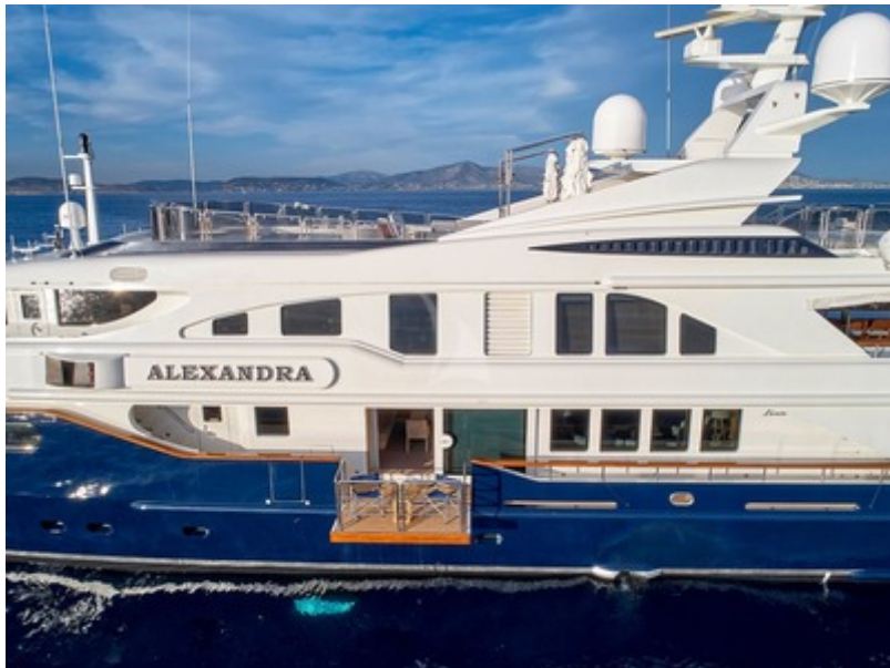
Alexandra Balcony View 1