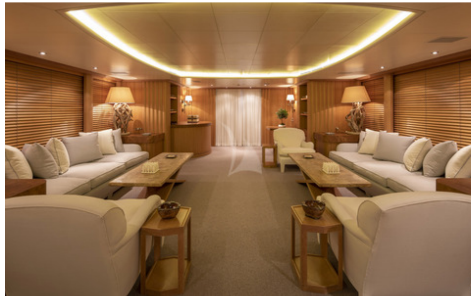
Main Deck Salon 2