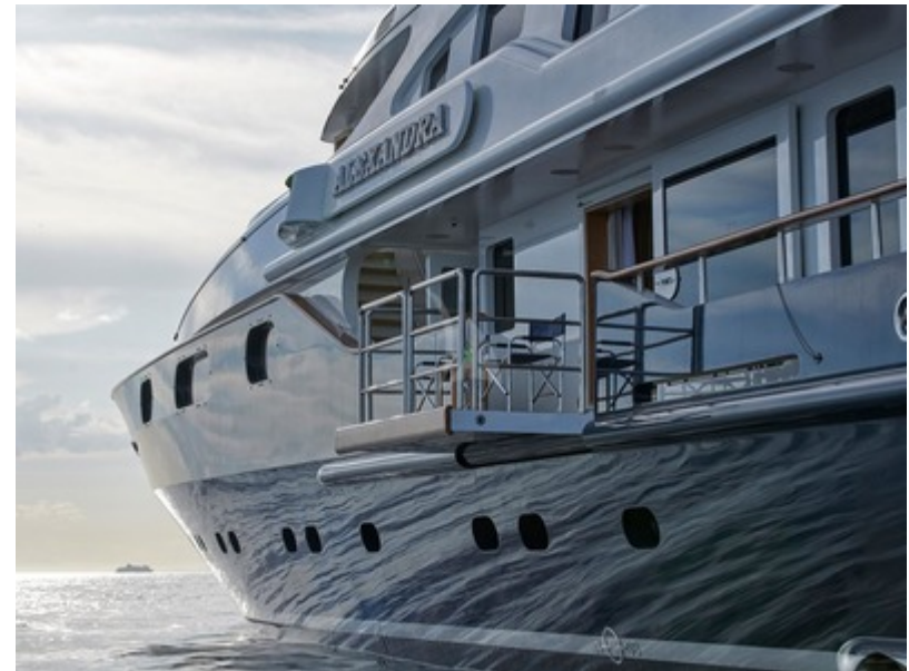
Alexandra Balcony View 2