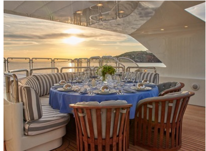
Sundeck Dining Table 2