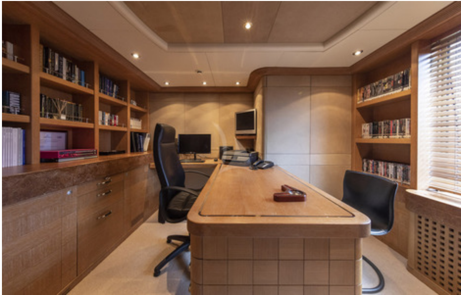
Master Suite Office