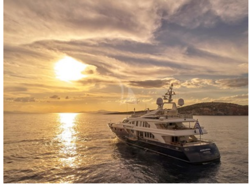
Alexandra at Sunset 2