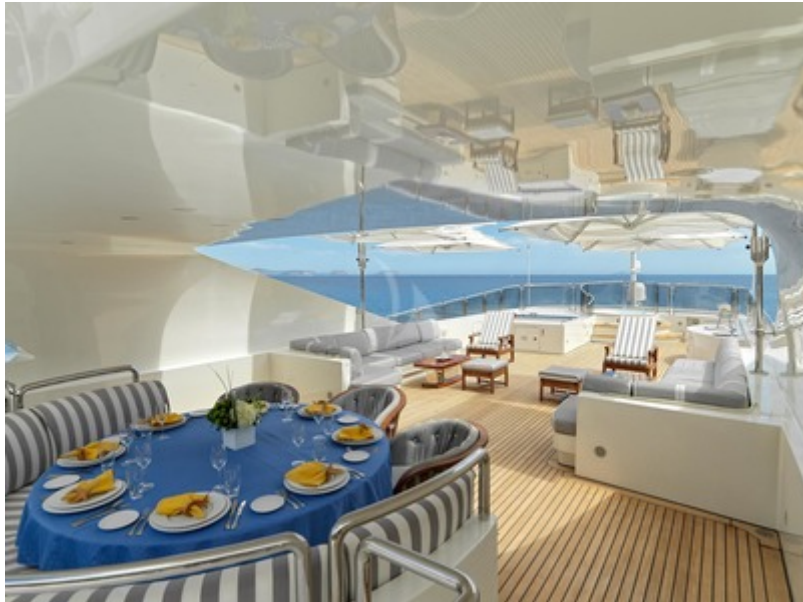
Sundeck Dining Table 1