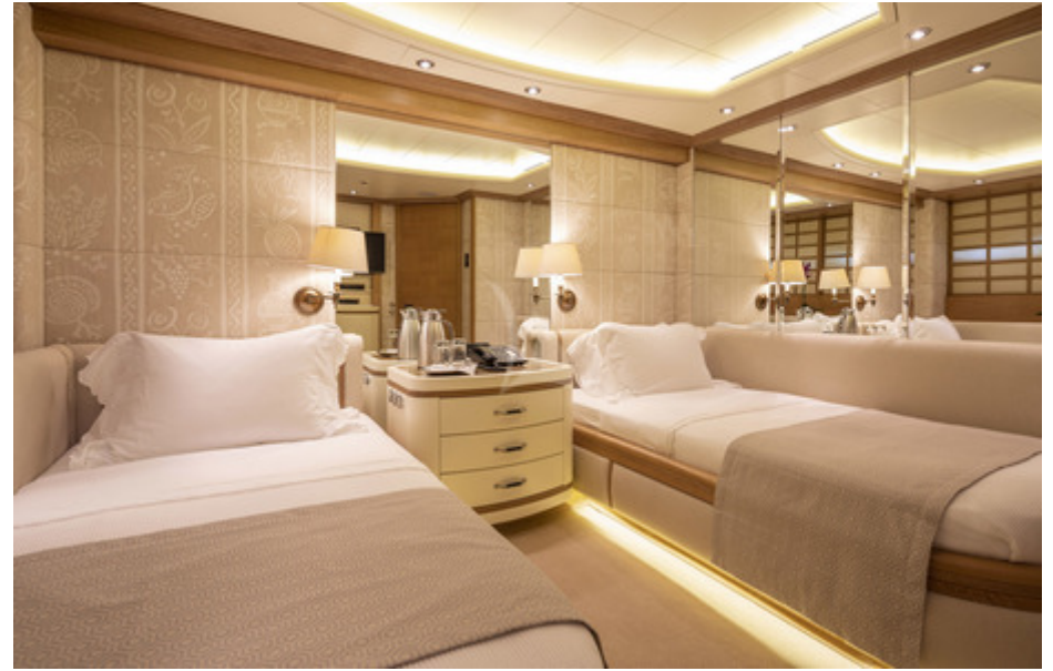
Twin Stateroom II