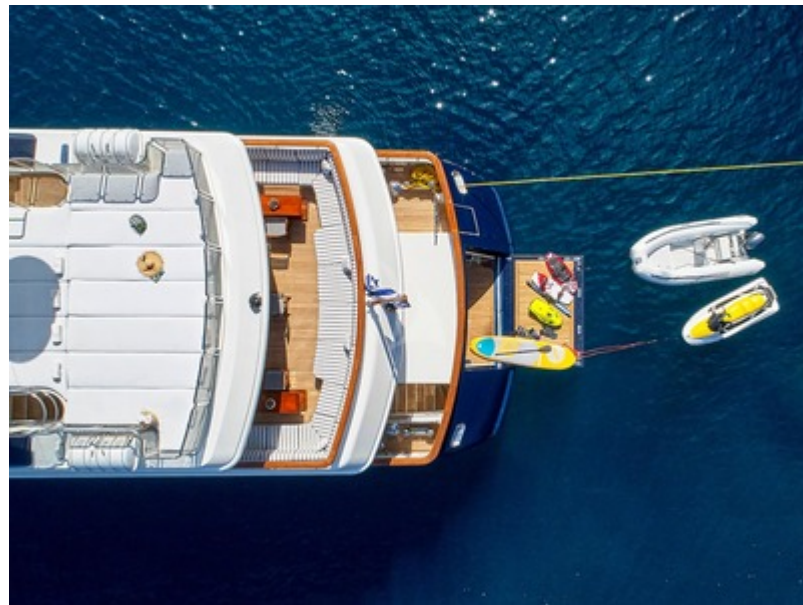
Alexandra Aerial View 4