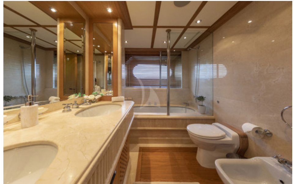
VIP II Suite Bath