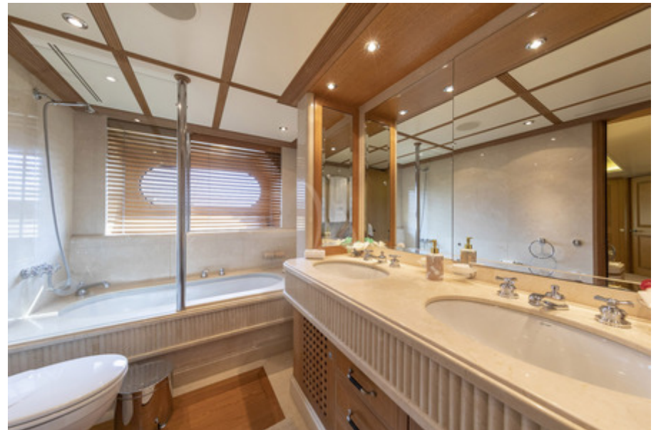
VIP I Suite Bath