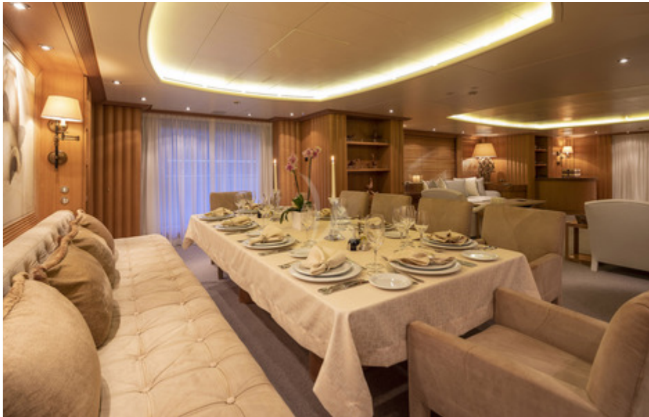
Dining Table 2