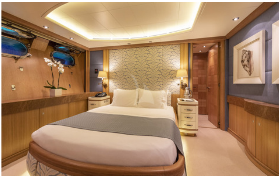
Double Stateroom I