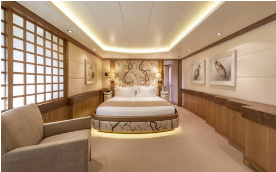
VIP I Suite 1