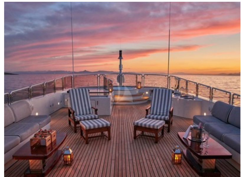
Sundeck at Sunset 1