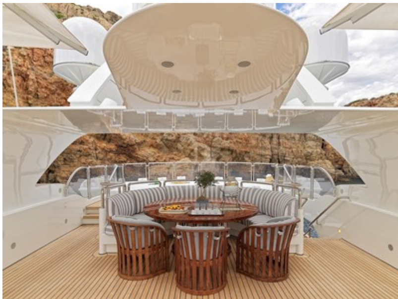
Main Deck Aft 1