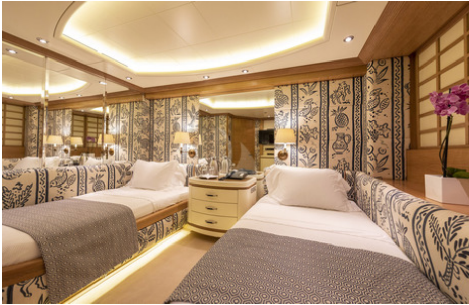
Twin Stateroom I