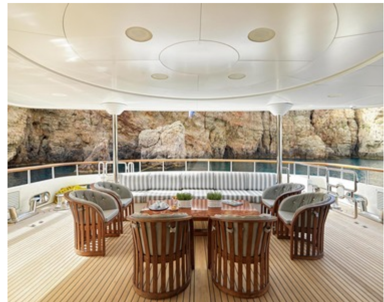
Main Deck Aft 2