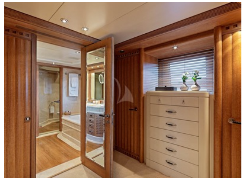
Master Wardrobe Bath Area