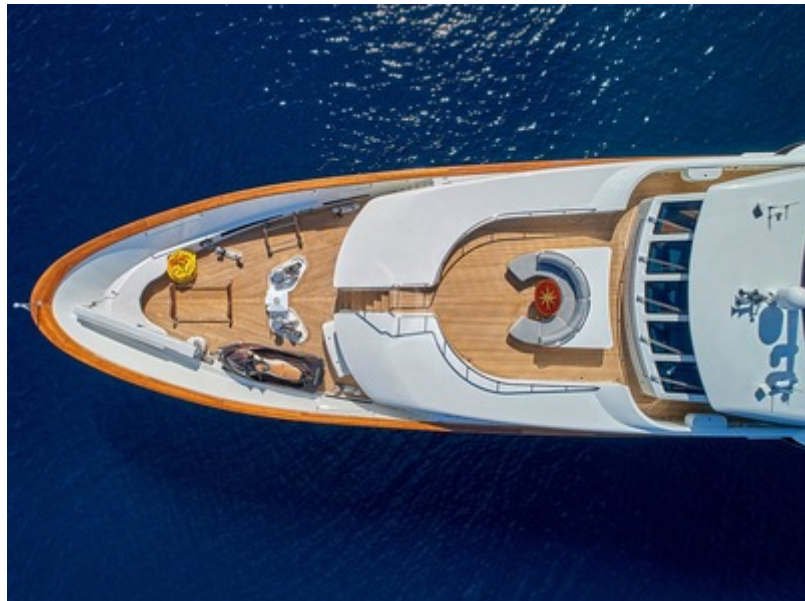
Alexandra Aerial View 1