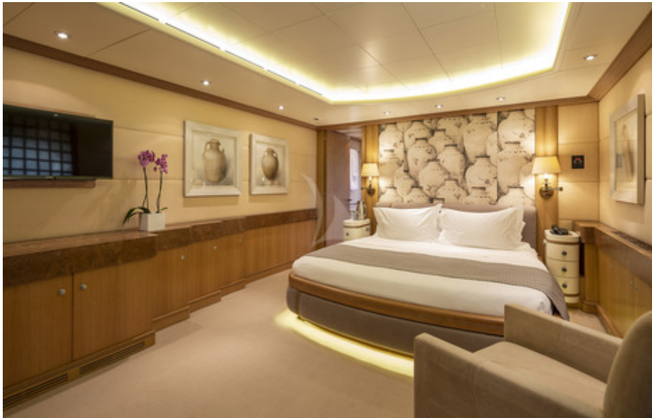
VIP II Suite