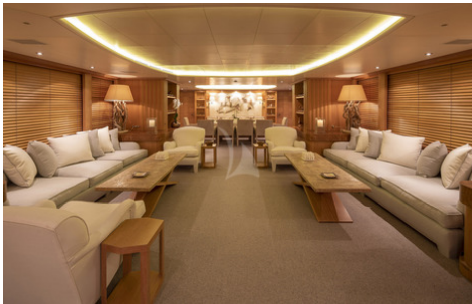
Main Deck Salon 1