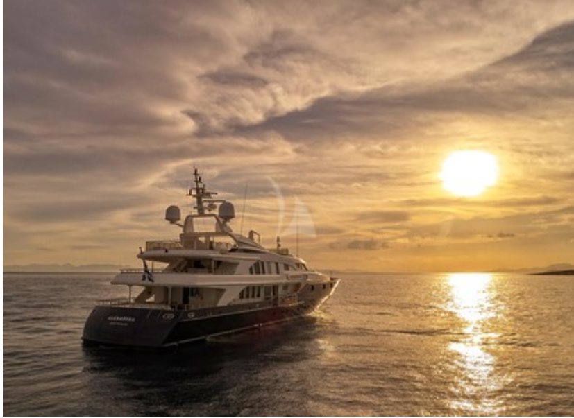
Alexandra at Sunset 1