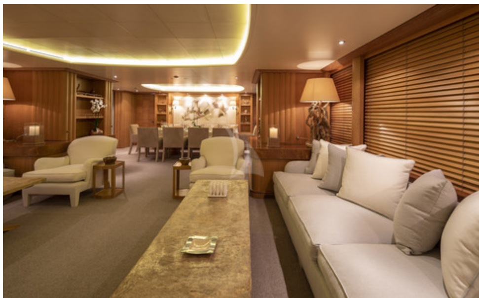
Main Deck Salon 3