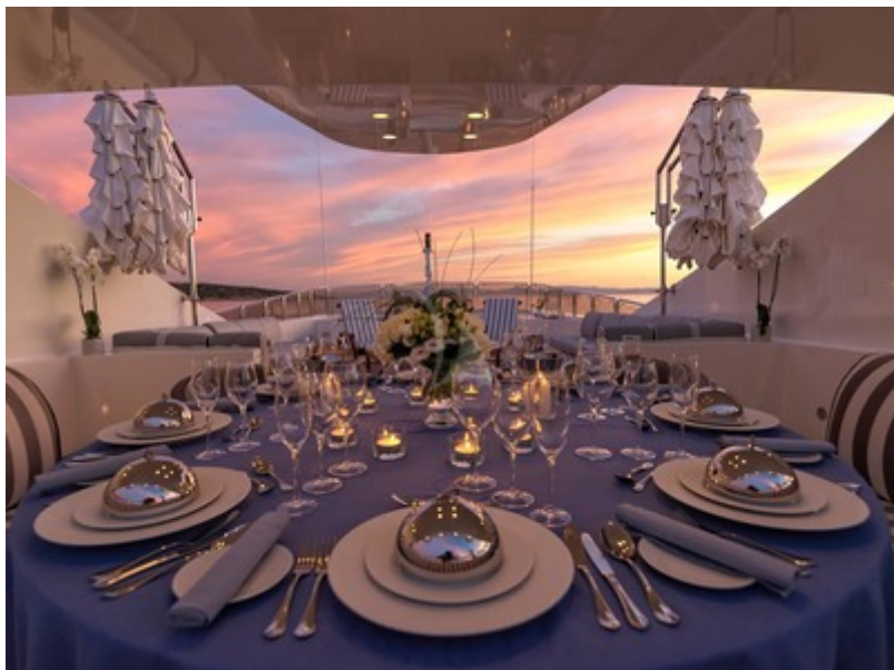
Sundeck Dining Table 3