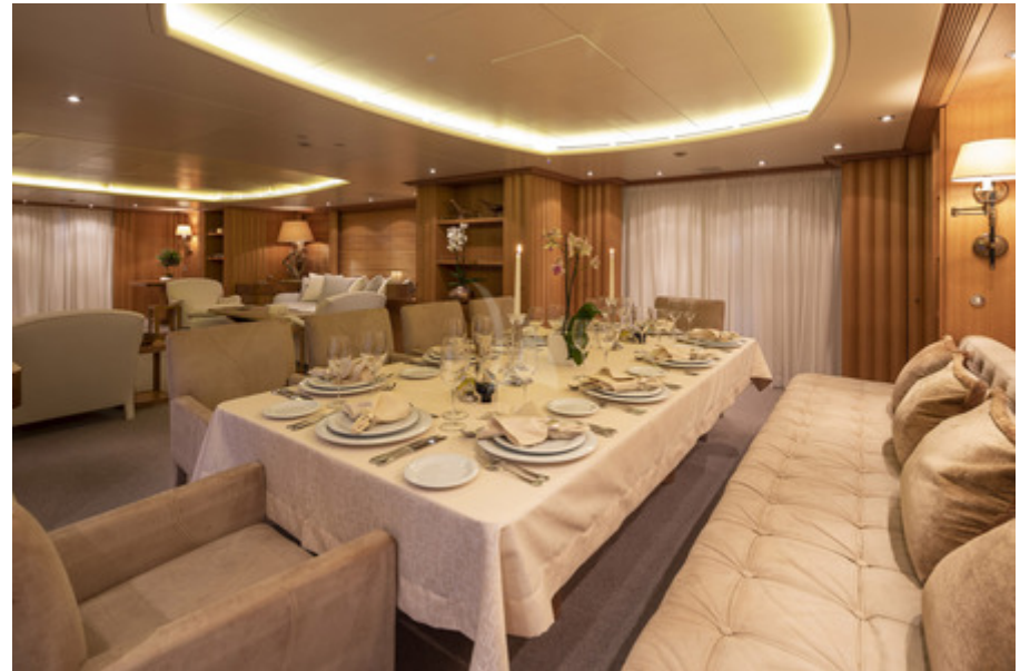
Dining Table 3