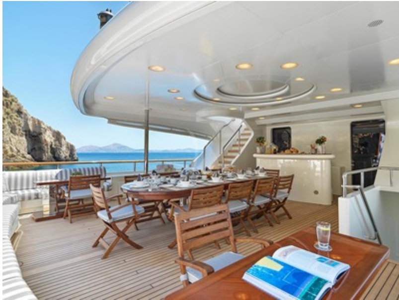
Upper Deck 1