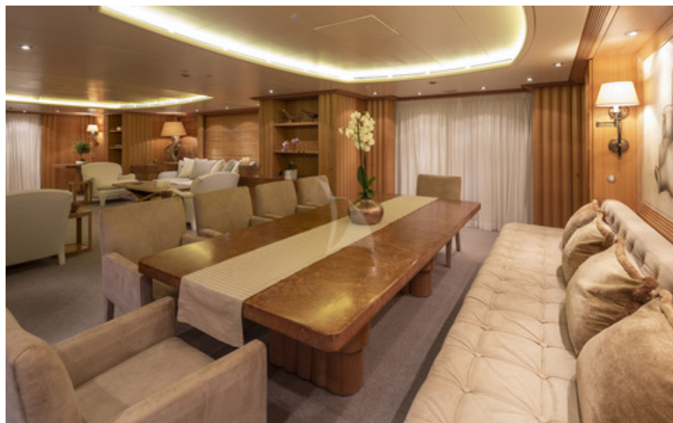
Dining Table 1