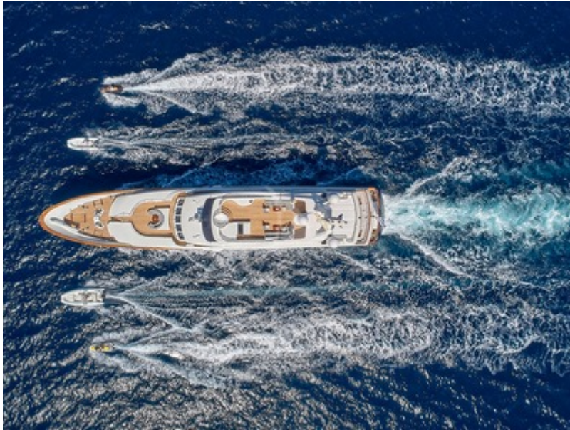
Alexandra Aerial View