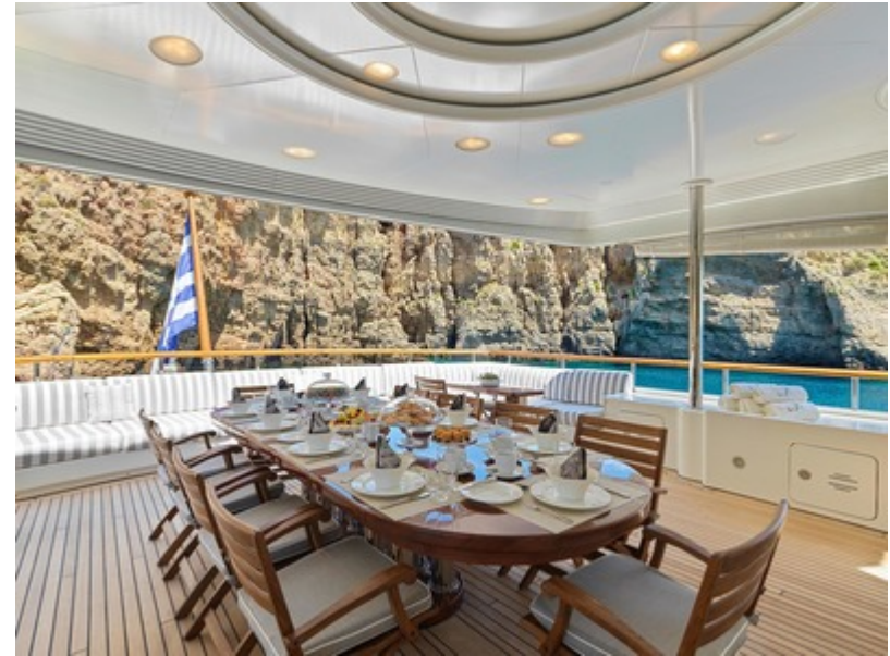
Upper Deck 2