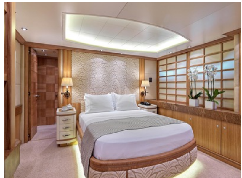
Double Stateroom II