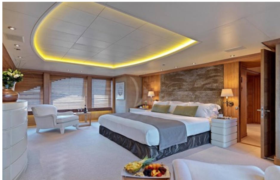
Master Suite 1