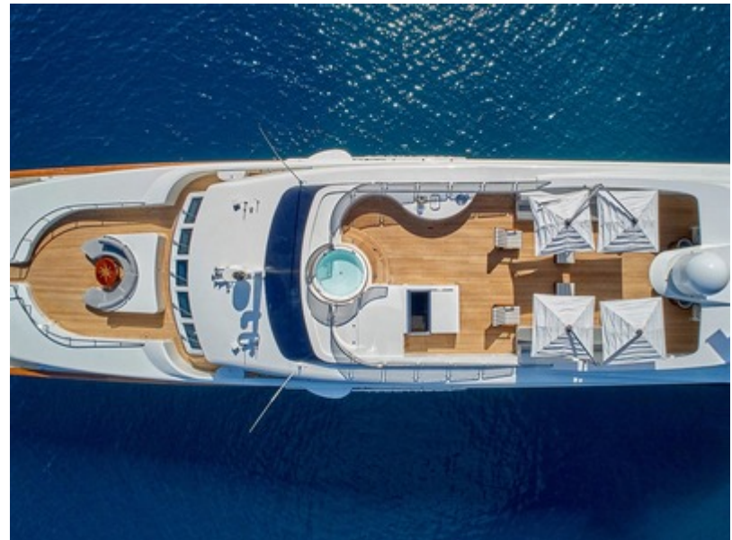
Alexandra Aerial View 2