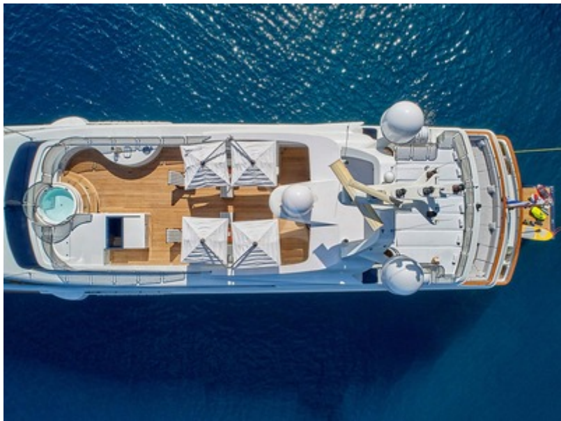
Alexandra Aerial View 3