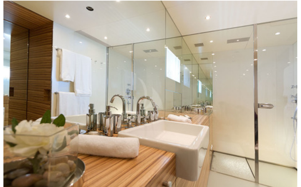
VIP bath 1