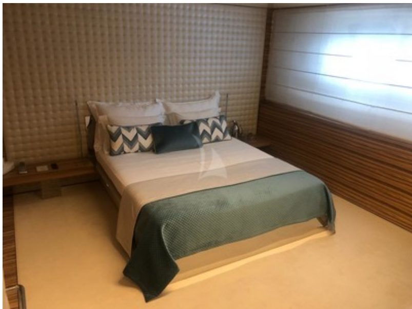
VIP Suite aft new 1