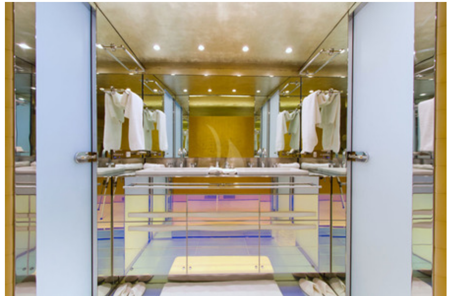
Master Suite Bath 2