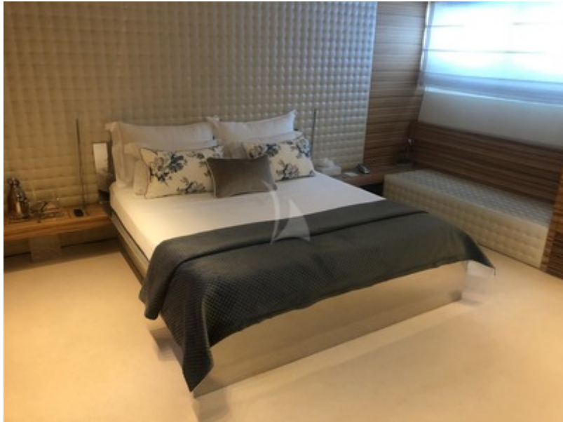
VIP suite forward new 2