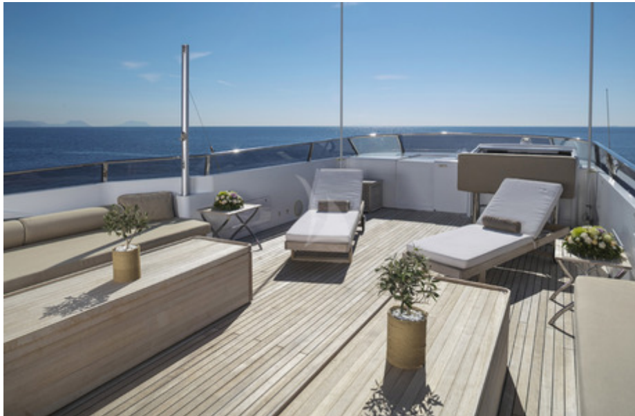
Upper deck lounging