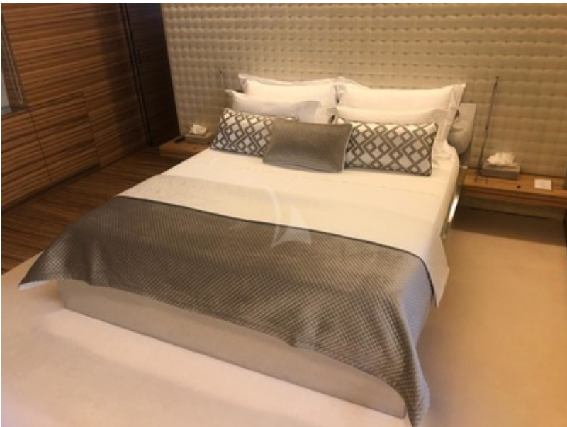
Master suite new 2