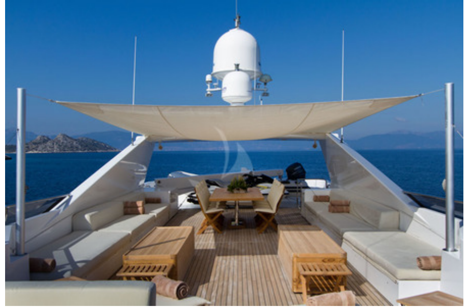
Upper deck full view