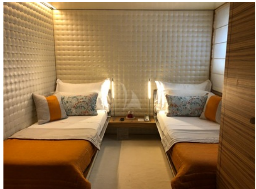
Twin stateroom 1