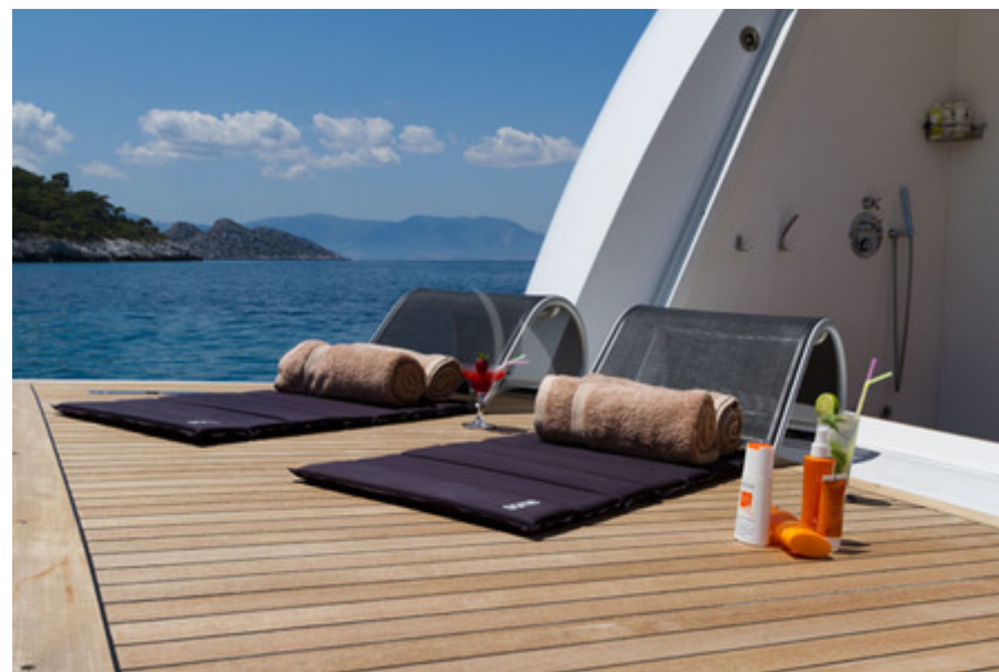
Sunbathing platform 1