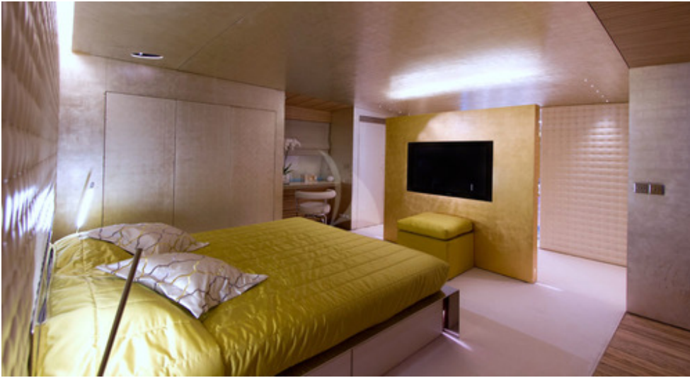
Master suite 1