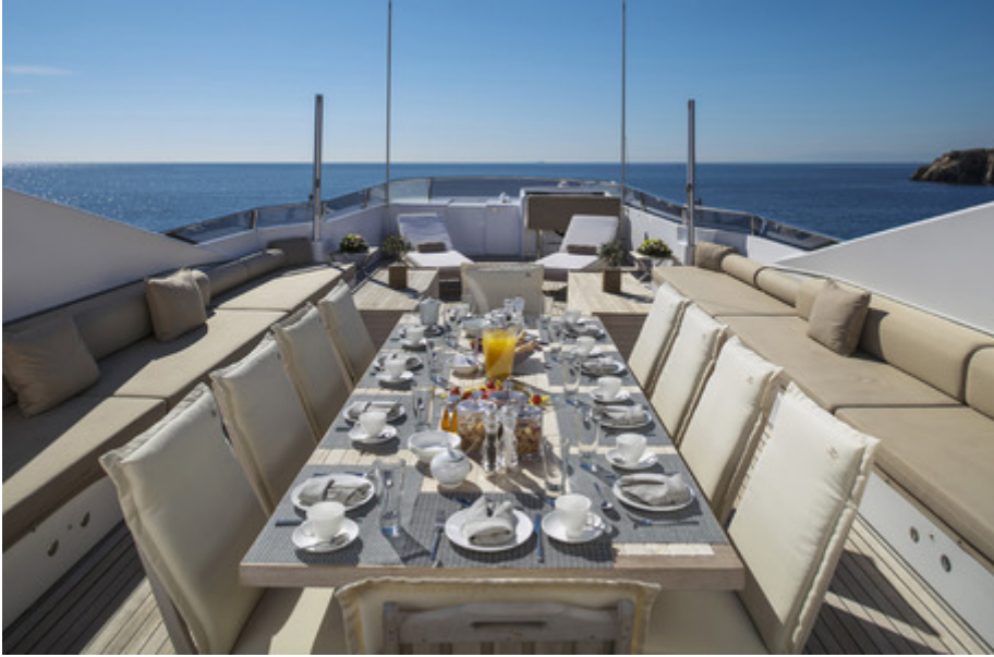
upper deck dining