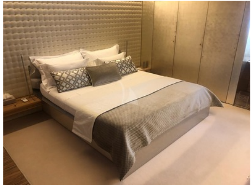
Master suite new 1