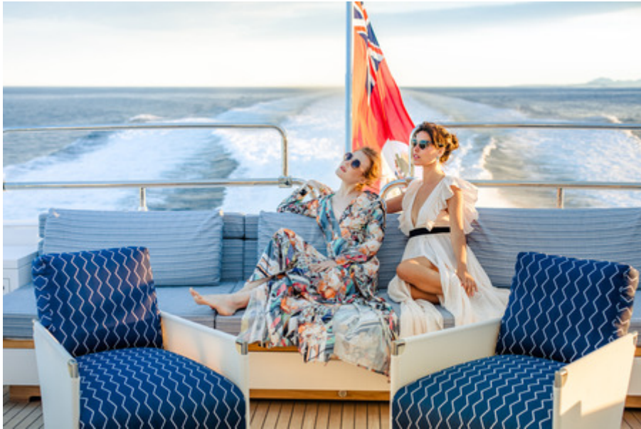
Enjoying the cruise