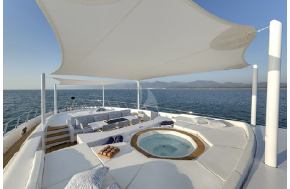
Jacuzzi on the foredeck