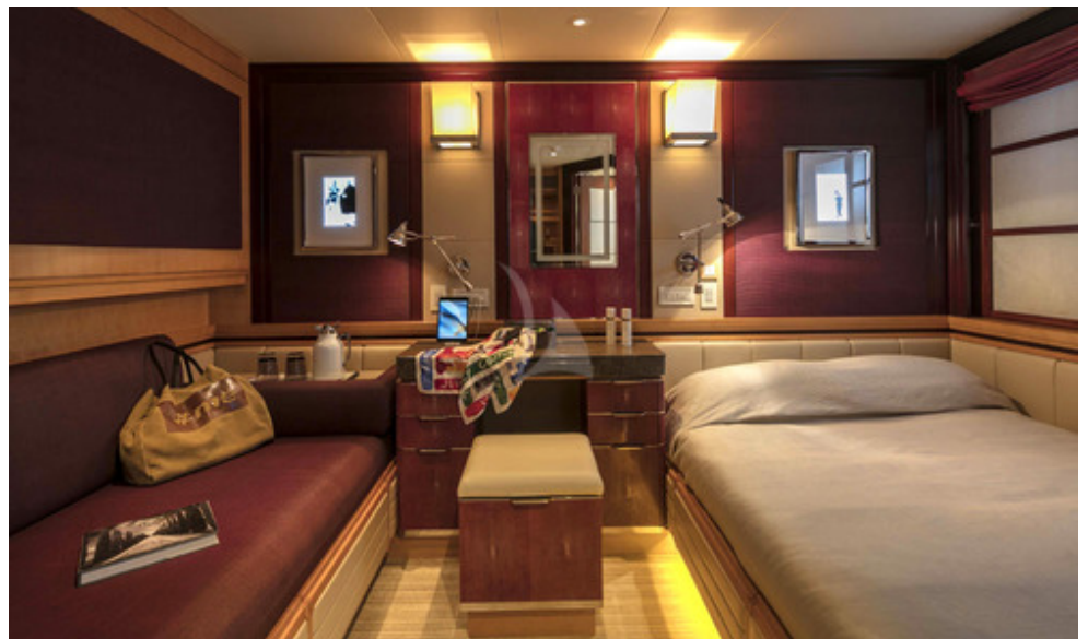
Twin II Stateroom 2