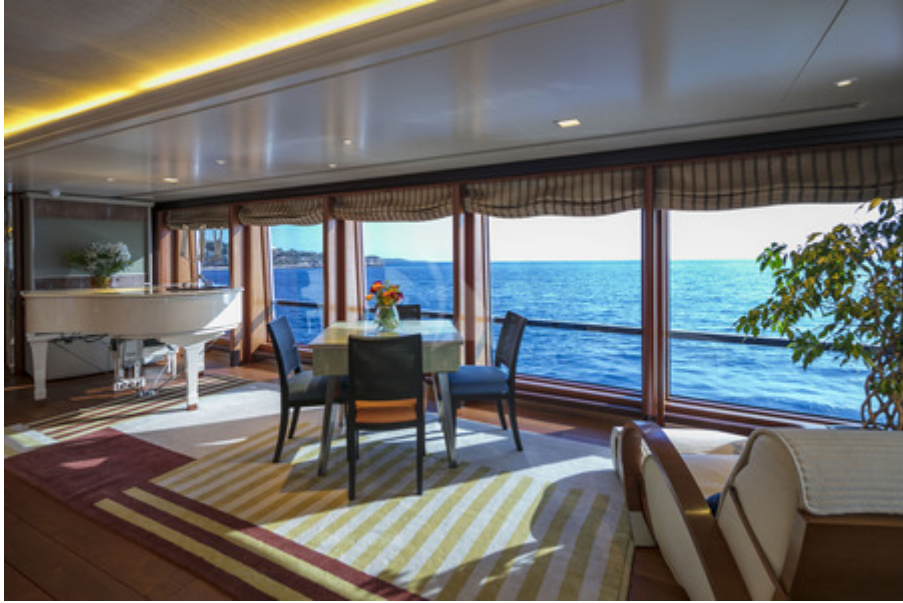
Upper Deck Salon 1