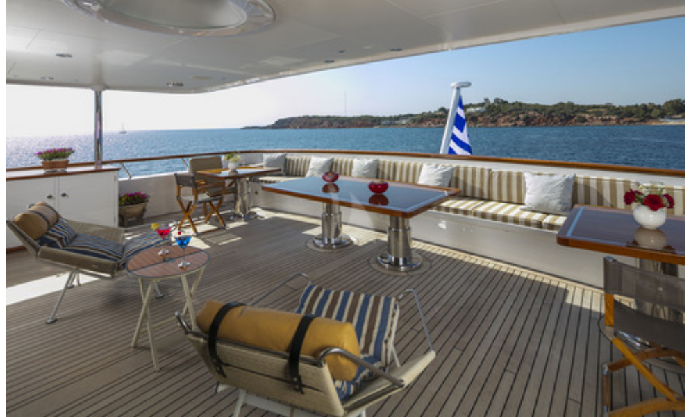
Upper Deck Aft 2