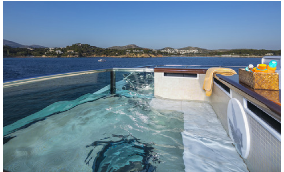
Sun Deck Plunge Pool 2