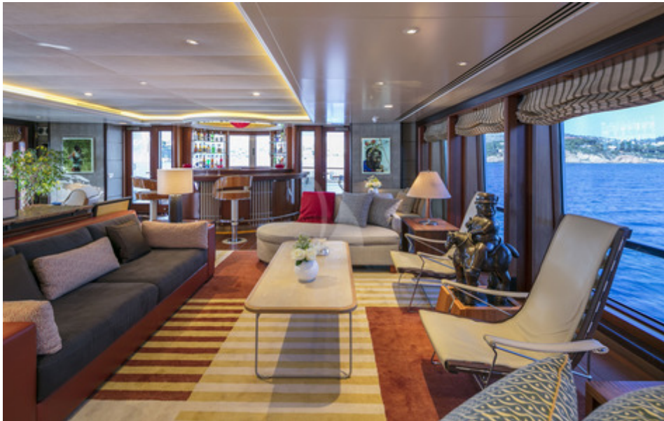
Upper Deck Salon 3