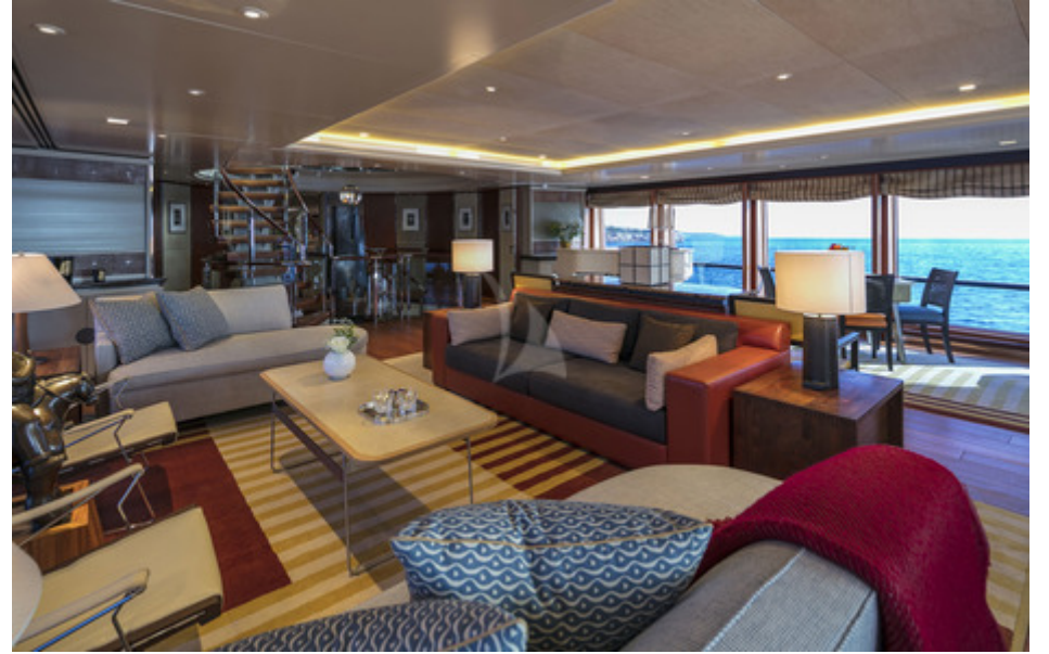
Upper Deck Salon 2