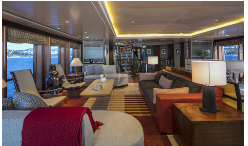
Upper Deck Salon 4