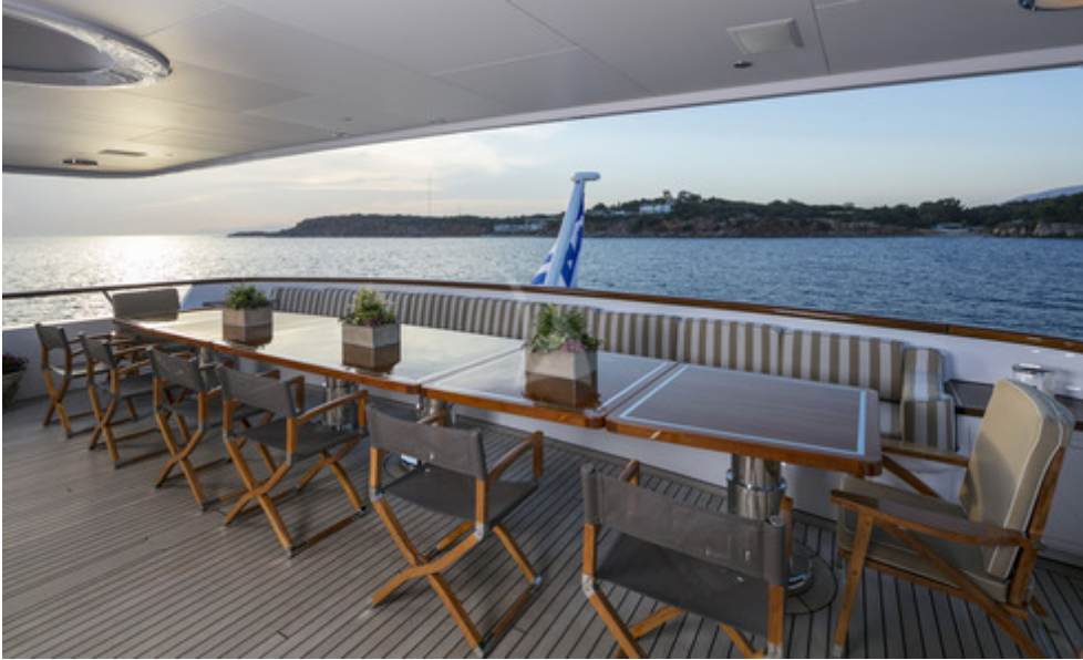
Upper Deck Aft 1