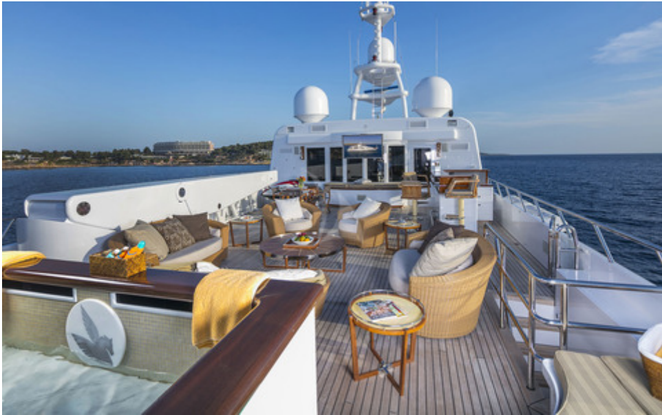
Sun Deck Plunge Pool 1