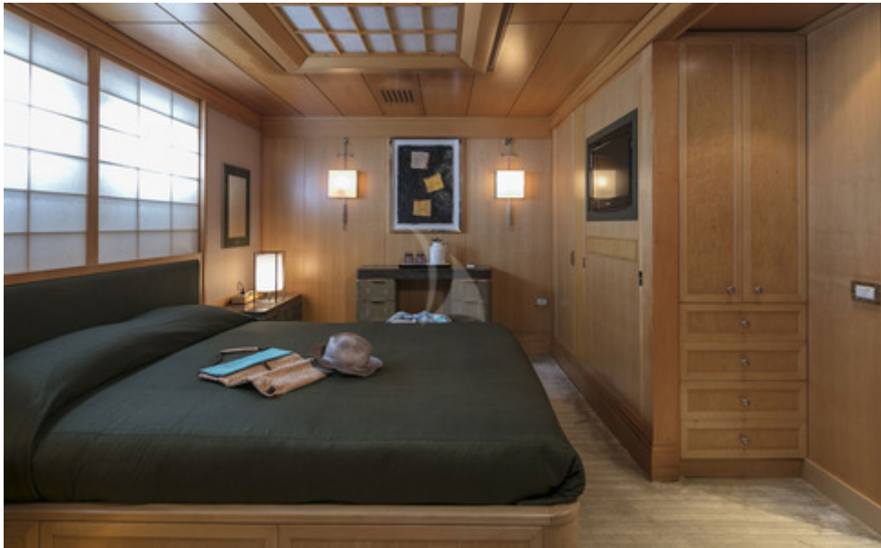
VIP II Suite