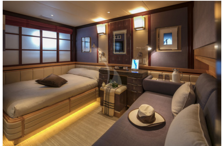
Twin I Stateroom 2