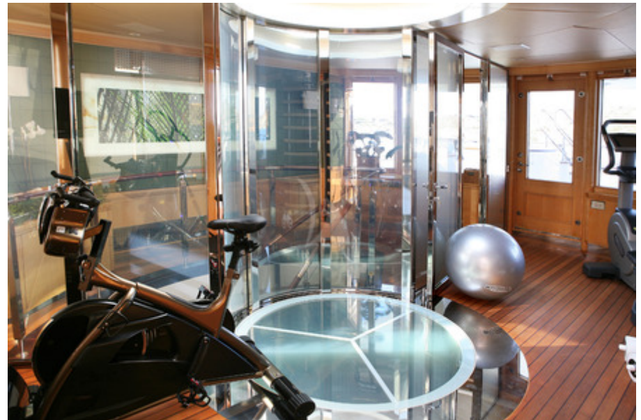
Gym on Sundeck