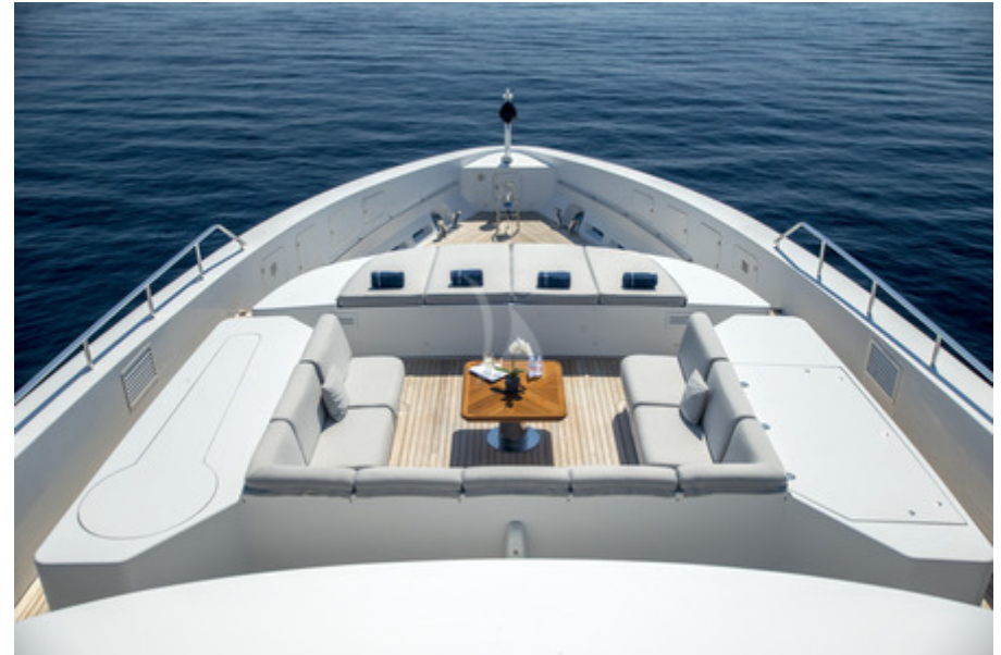
Bridge Deck with large sitting area and a massive sun pad