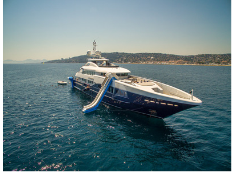
New Fun Air Giant slide