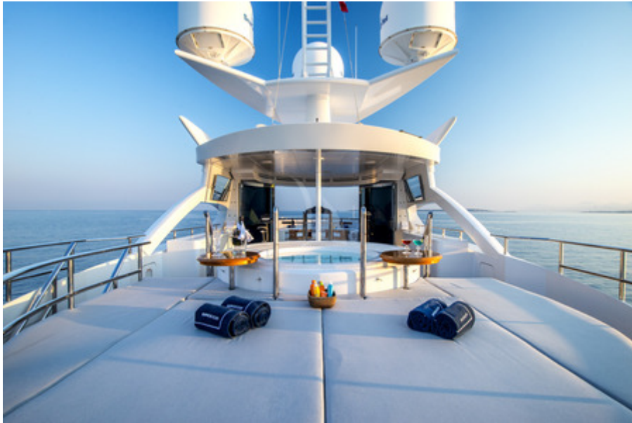
Top deck jacuzzi with sun pad