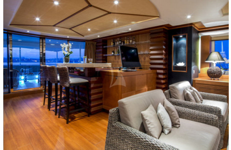
Main saloon bar