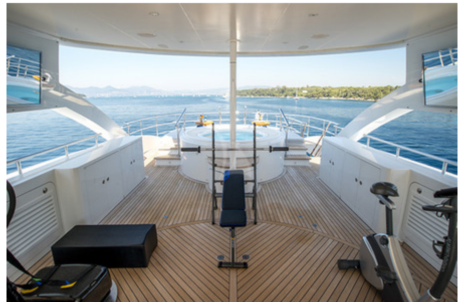
Gym on the top deck