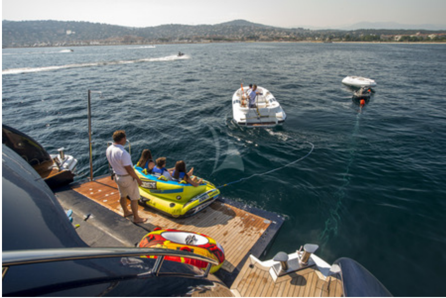
Tenders and toys