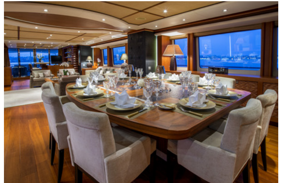
Dining area for 12 guests