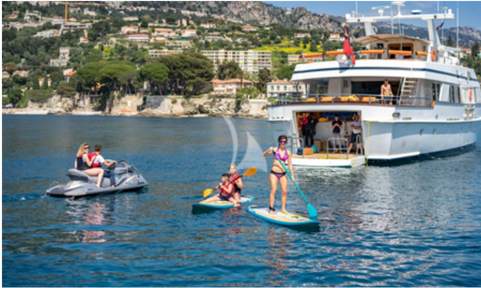
FIORENTE - At anchor - 2018