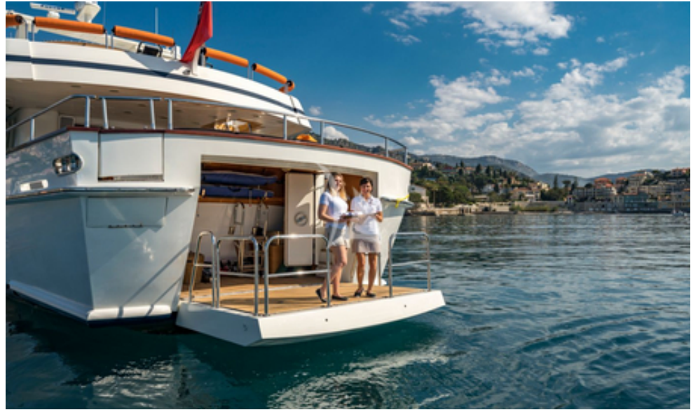
FIARENTE - Welcome on-board - 2018