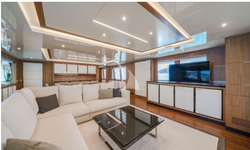
FIORENTE - Main salon - 2018