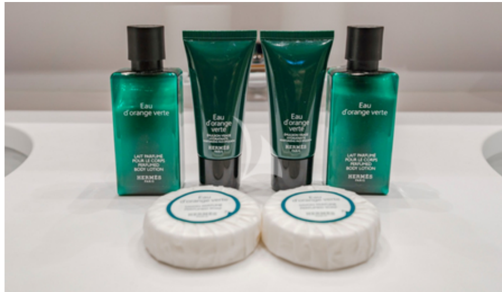
FIORENTE - Toiletries - 2018