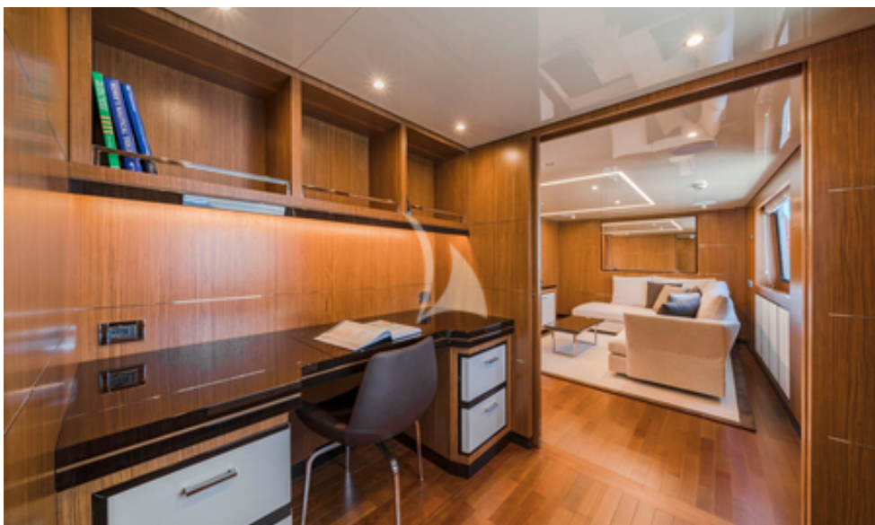
FIORENTE - Office - 2018