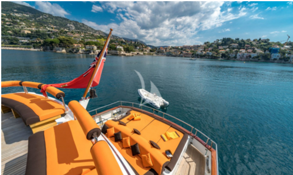
FiarenTE - View of the main aft deck - 2018