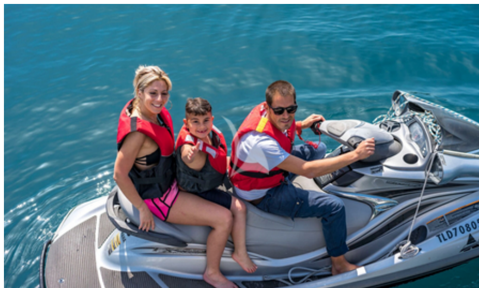
FIORENTE - Jetski Yamaha 1100cc - 2018