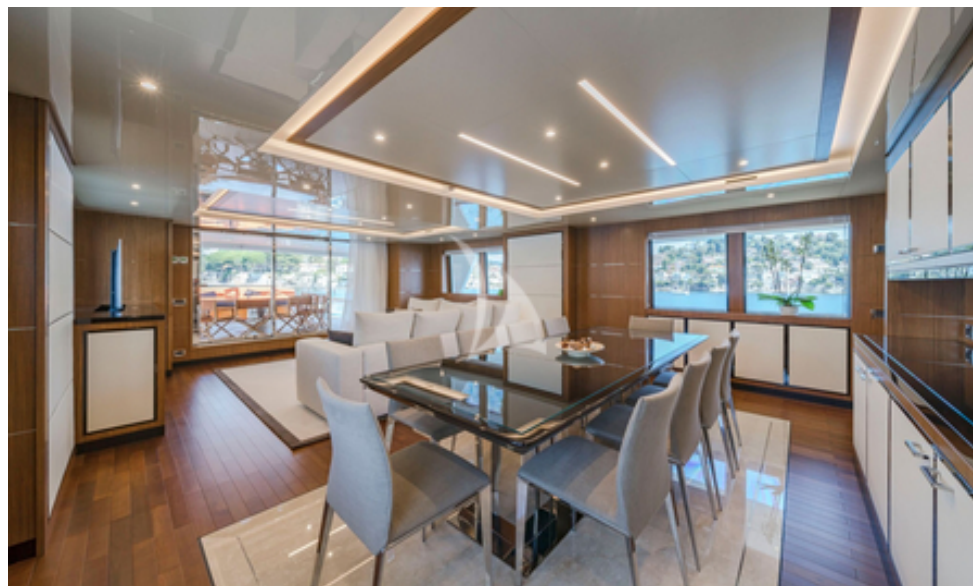
FIORENTE - Main salon - 2018