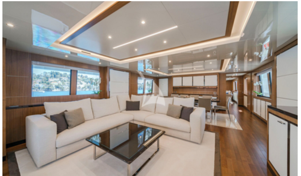
FIARENTE - Main salon - 2018