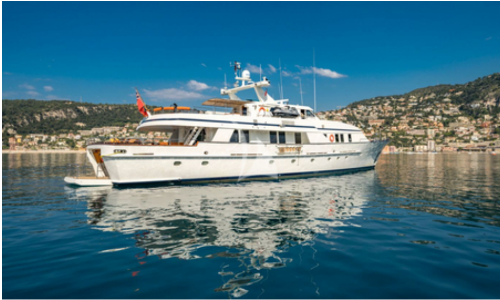
FIARENTE - Profile - 2018